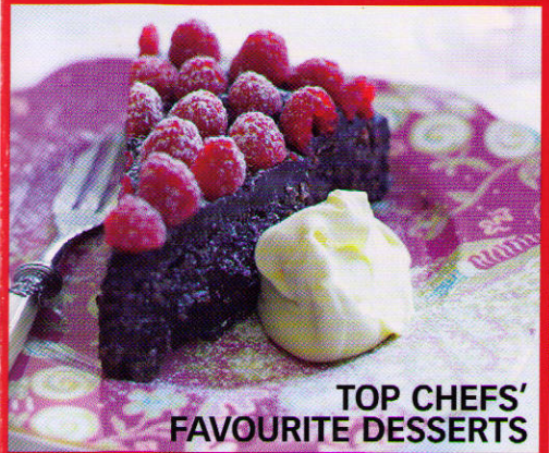
TOP CHEFS' FAVOURITE DESSERTS